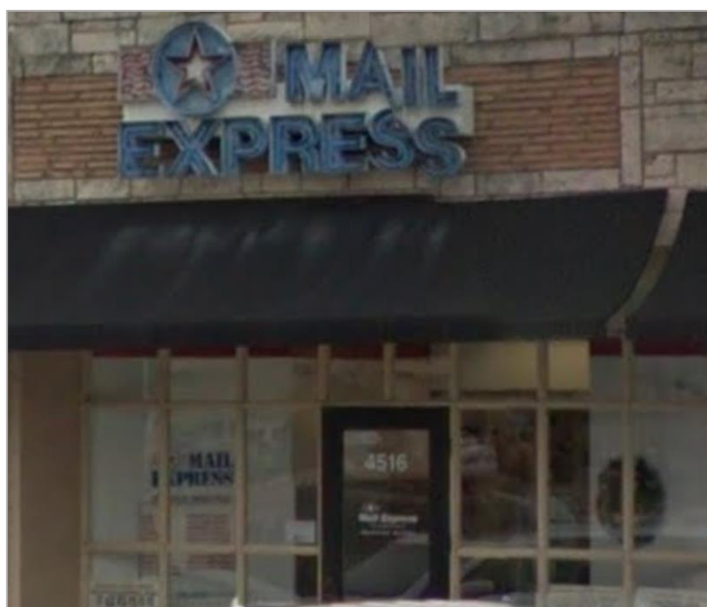
Figure 2 Extract of Google Maps Streetview of 4516 Lovers Lane Dallas, Texas

Note that the above table is only for one mail shop: Mail Express at 4516 Lovers Lane Dallas, Texas. Unsurprisingly there is not a medical complex at that address: