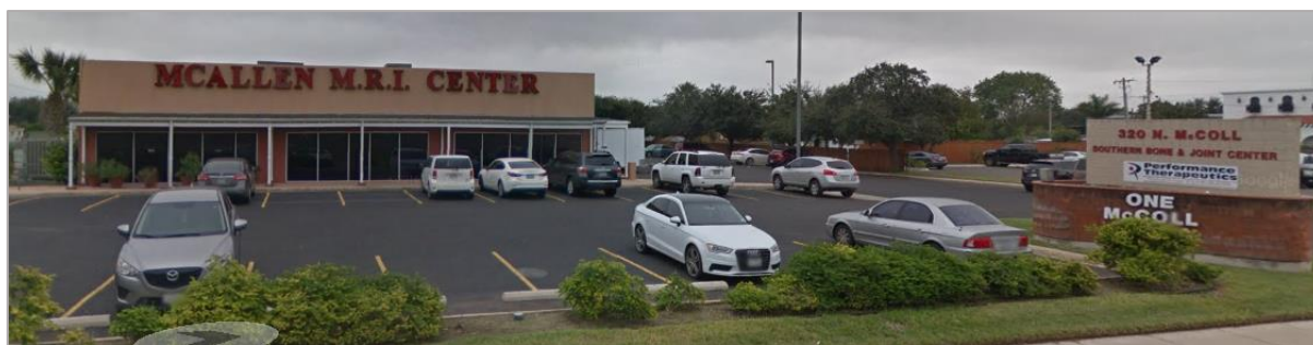
Figure 12 Google Streetview snapshot of 320 N McColl Rd McAllen